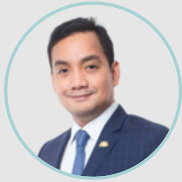
YAB DATO' ONN HAFIZ BIN GHAZI PRESIDENT